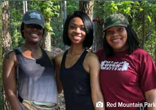
📷 Red Mountain Park

These friends are hiking Red Mountain Park for the first time in Birmingham, AL.